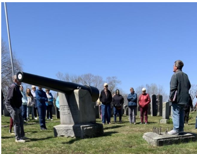
Coventry's Civil War Monument in the cemetery

As part of the Last Green Valley's Walktober event, 3 walks on Coventry's historic Depot Road along the Mill Brook are being held.