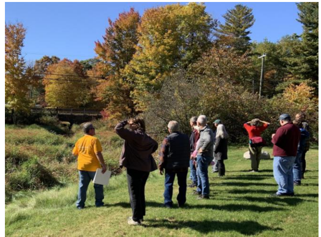
Getting a peek at the arches built to accommodate the arrival of the Trolley in 1909

During our walk we talk about the impact of Coventry's waterways on our history and the evolution of our roads before focusing more specifically on the historic Depot Road neighborhood. There is still one more opportunity to enjoy this walk on November 5. ! Look for walk number 56 in the Last Green Valley Walktober guide- https://thelastgreenvalley.org/explore-the-last-green-valley/walktober/