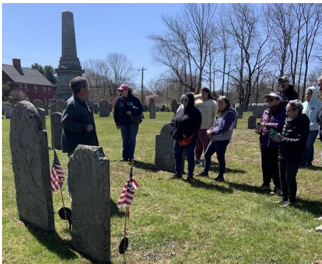
Nathan Hale Monument in the background