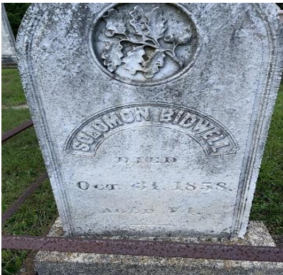
Solomon Bidwell, founder of your feast, buried in the Nathan Hale cemetery

Original Bidwell Tavern built by Solomon Bidwell in 1822