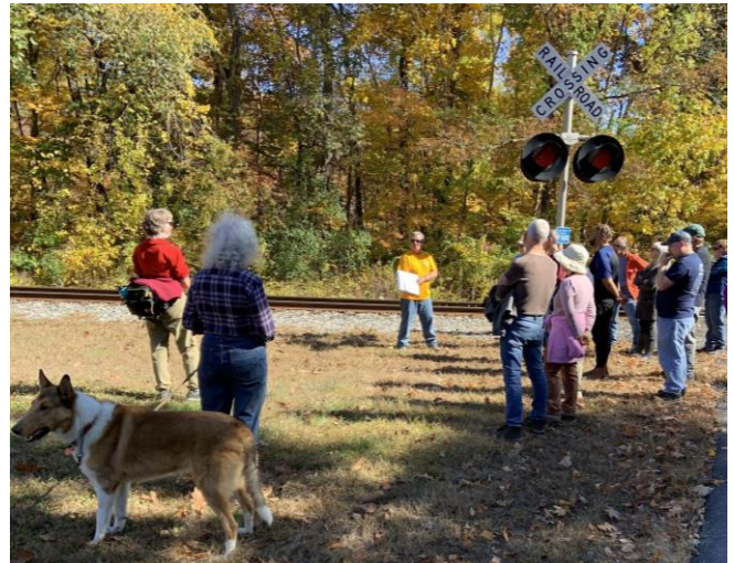
The Railroad arrived in Coventry in 1850

As part of the Last Green Valley's Walktober event, 3 walks on Coventry's historic Depot Road along the Mill Brook are being held.