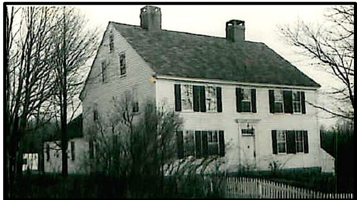
#1804 Boston Turnpike ~ 1965

Tavern and stage house built on the north side of the Boston Turnpike in 1801 by Eleazer Pomeroy (2 nd ). He acquired the land from Noah Porter. The stage house was originally in the Hunt house to the west, but the stages were moved to this location before 1810. Eleazer operated stages and purchased 72 acres south of the turnpike across from the meetinghouse where another house was built in 1833. (1) Eleazer Pomeroy 2 nd and 3 rd (1776-1867) have been proprietors of this establishment. (7)